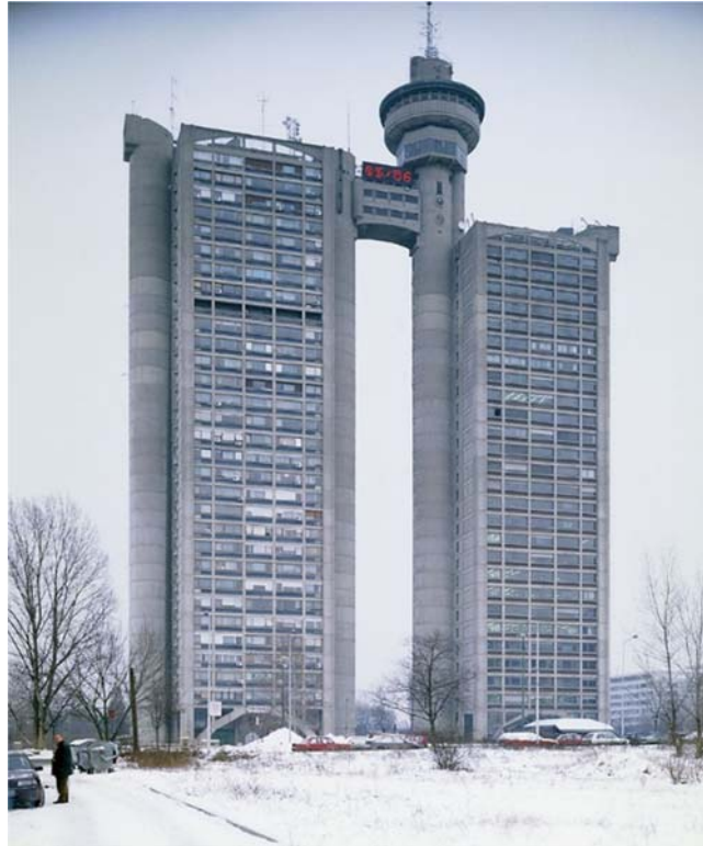
Source: Wiki Commons CC BY-SA 3.0; author: Błażej Pindor; December 1, 2003

themselves explore various areas of interest helped by visual or textual sources, often coming from sources other than tourism publications (Plate 9).