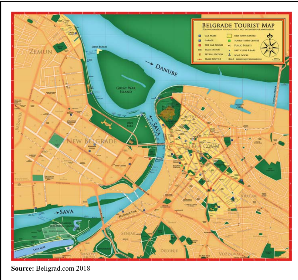
Figure 1 Map of the city of Belgrade with New Belgrade on the left side of the river Sava