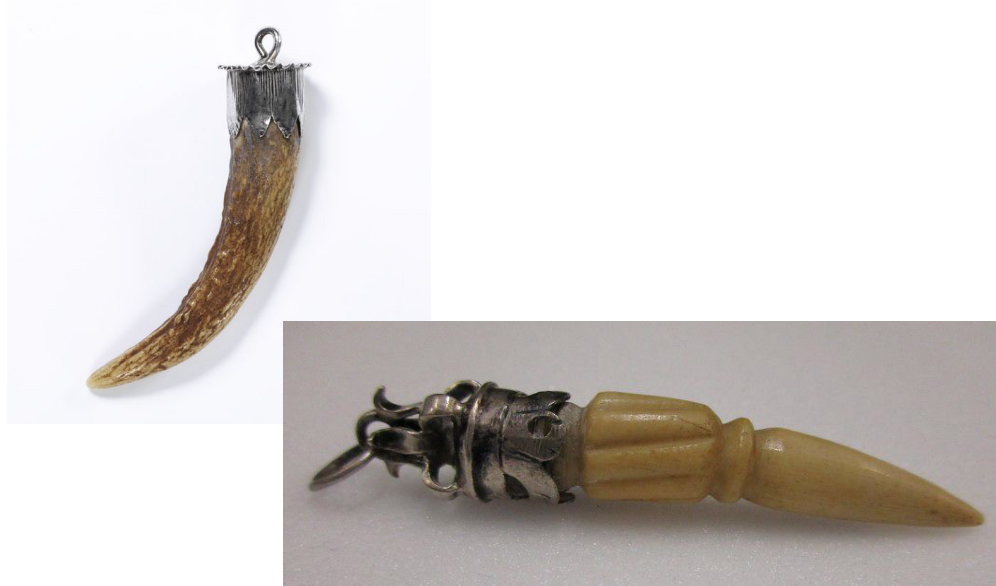
Fig. 6. 19 th century stag's horn amulets [Spanish]. Left: V&A M.14-1917 [Length 95mm]. Right: V&A M.18-1917 [Length 65 mm]. Hildburgh Gift.

The Geoponica , a collection of 10 th century agricultural lore compiled in 20 books for the Byzantine emperor Constantine VII Pyrogenitus at Constantinople, records the use of hart's horn amulets around the necks of horses in order to prevent them from falling ill [52 p93].