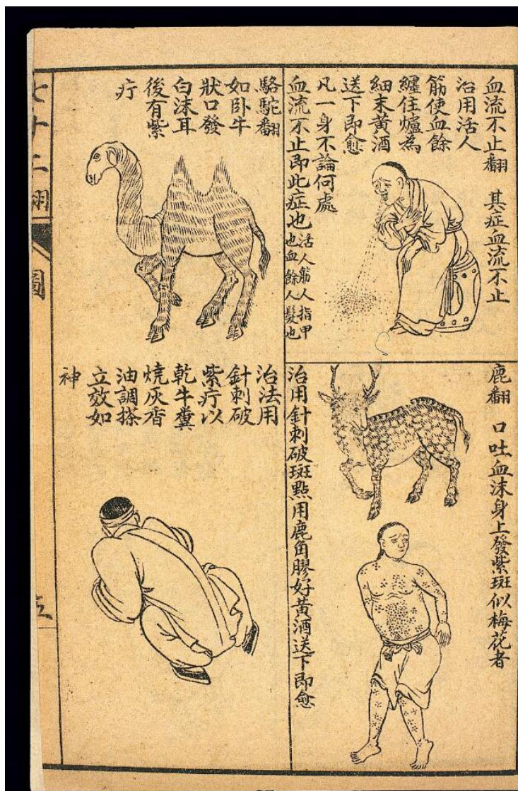
Fig. 8. Early 20 th century Chinese lithograph: 'Fan' diseases, including Deer fan. Wellcome Collection.