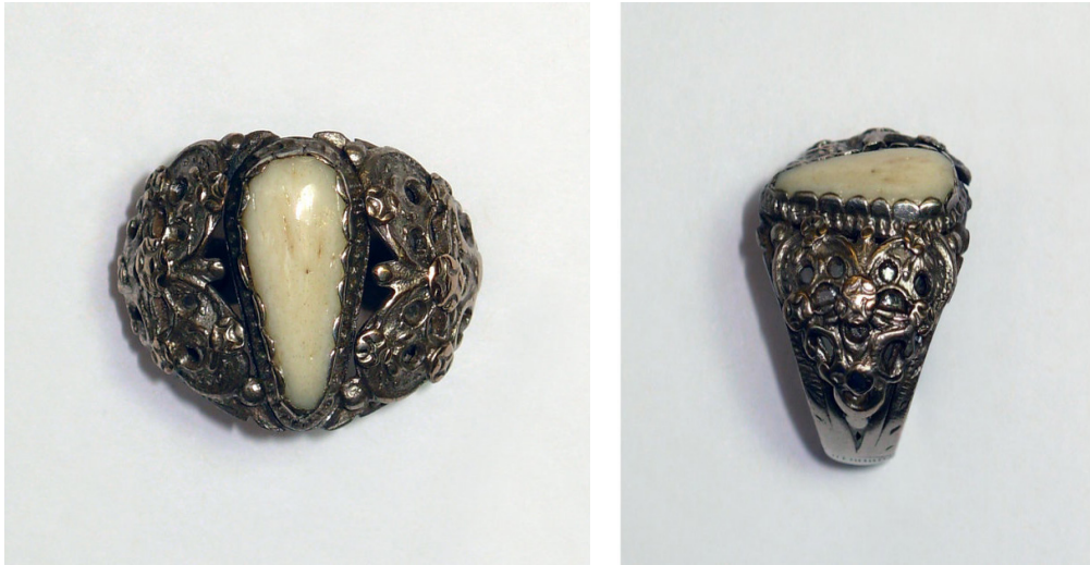
Fig. 5. 19 th century silver ring with red deer tooth. V&A 173-1872.

Often harvested from the carcass as trophies of the hunt, deer teeth were frequently worked into items of amuletic jewellery and worn for good luck [especially when hunting] and protection against snakes and eye diseases [13 p109]. Mounted in finger rings, these Hirschgranl were used as amulets against toothache in Austria [14 p150] [Fig. 5].