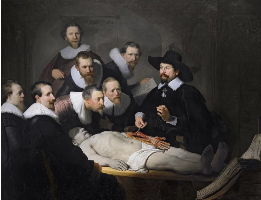
Fig. 3. The Anatomy lesson of Dr. Nicolaes Tulp by Rembrandt. (published with permission from Mauritshuis, The Hague) [12].

Rembrandt van Rijn immortalised the life-size dissection of the body of Aris Kindt, the criminal hanged the night before, by Dr Nicolaes Tulp on a canvas measuring 216.5 x 169.5 cm.