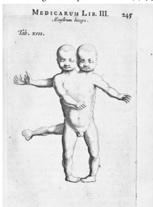
Fig 2. A representation of Siamese twins from the Observationes Medicae [14].

Interestingly, Dr Tulp was also involved in politics. He entered the Municipal Council of Amsterdam in 1622. As he served in the Council as a permanent member, he often resolved local court disputes, also acted as the supervisor of Amsterdam Bank, and the city treasurer. When he was thirty-nine years old (1653), he was elected the mayor of Amsterdam. He performed the function of the mayor in four mandates. Dr Nicolaes Tulp died in The Hague on September 12 th , 1674. [13].