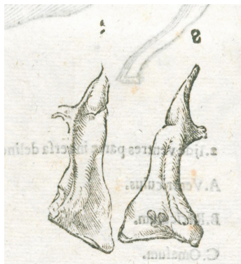
Fig. 3. Os e corde cervi from the red deer [ Cervus elephas ] from Aldrovandi [1642]: Paralipomena Accuratissima Historiae Omnium Animalium [Wellcome Collection].

The os cordis is a heterotopic bone – an ossification developing in the soft tissues and unrelated to the axial and appendicular skeleton. Two os cordia develop in the fibrous trigones of the heart as a result of age-related mineralisation and confer additional stability during cardiac contraction and relaxation. In addition to being a trophy of the hunt, perhaps unsurprisingly, the Stag's heart bone was deemed particularly efficacious in the treatment of cardiac conditions. Gaston Fébus [11 th Count of Foix and viscount of Béarn; 1331-1391] dedicated his Livre de Chasse , written some time between 1387 and 1389, to Philip the Bold, Duke of Burgundy [1342-1404] [6 p21]. In an English translation from the early 15 th century the bone is described as having 'great medicine, for it comforteth the heart, and helpeth for the cardiac, and many other things which were too long to write, the which bear medicine and be profitable in many diverse manners' [7 p34].