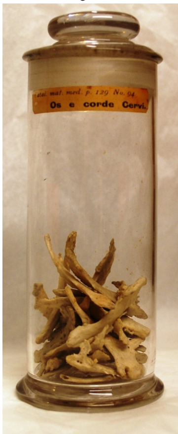
Fig. 4. Os e corde cervi from the red deer [ Cervus elephas ]. Burges Collection, Museum of the Royal Pharmaceutical Society.

The morphology of a typical specimen was illustrated by the Italian naturalist, Ulisse Aldrovandi [1522-1605], in 1642 [12 p126; Fig. 3]. Specimens survive in several materia medica cabinets dating from the early 18 th century [e.g. Heberden's cabinet in St John's College, Cambridge], although in many cases they seem to have been substituted by equivalent bones from oxen [Fig. 4].