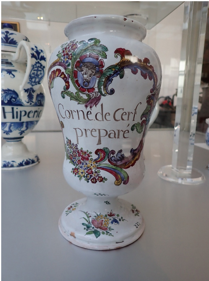
Fig. 7. Drug jar for prepared stag’s horn, 18 th century, Lunéville. Pharmazie Museum, Basel University.

Simple processing involved burning the horn until it passed from black through to white in colour. This was referred to as Cornu cervi praeparatum and is one of the common forms of storage for which dedicated drug jars were produced [Fig. 7]. The fumes from the burning horn could be employed as a fumigant in the treatment of epilepsy [16 p51].