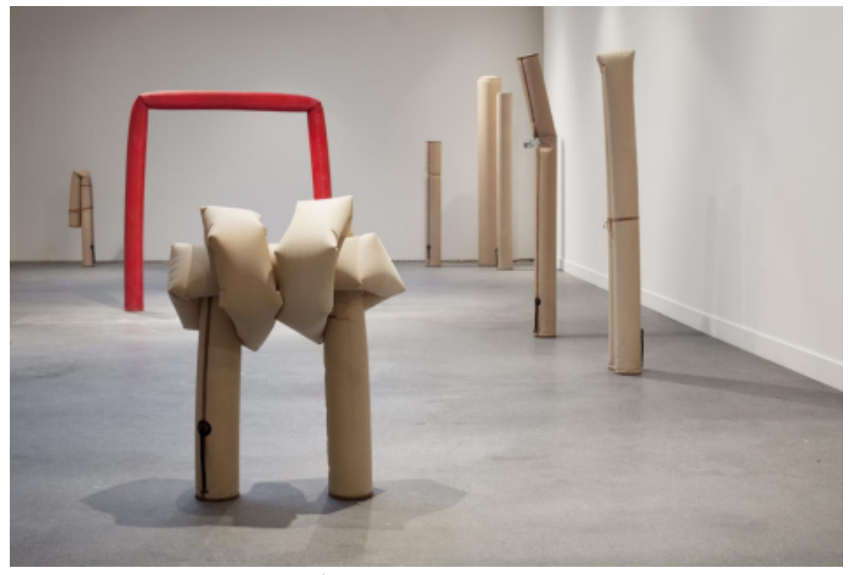
Inflatable sculptures by Willy Ørskov, from the late 1960'ties and 1970'ties